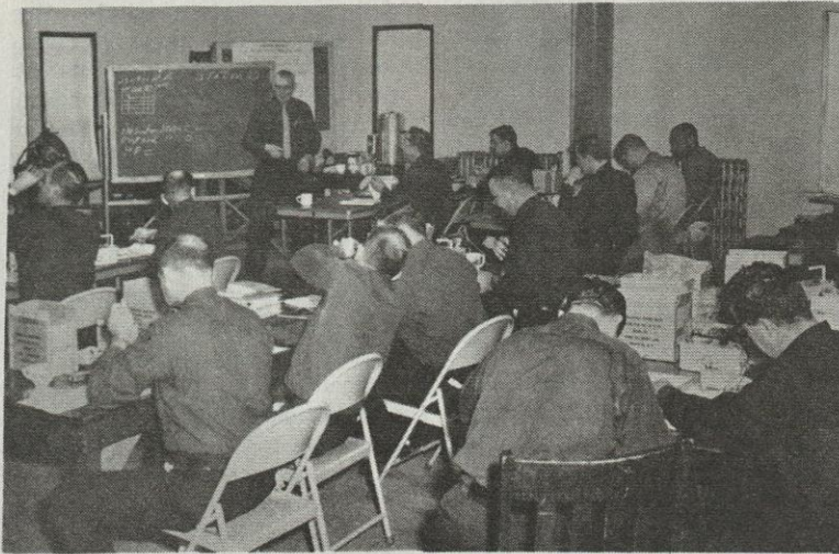
The above photograph was taken in the Fire Department classroom of the many Radiological classes held for all personnel of the South Bend Fire Department. These classes are of 16 hours duration and train the men to understand what radiation is, its effect on the human body and how to protect themselves and others in an emergency where and when radio active materials are involved.

This type of training has become a must for the men in the fire service, as the increase in the use of radio materials throughout our country for industrial purposes, for research and for medical diagnosis and treatment in addition to military use, has focused the attention on the need for qualified personnel to handle possible emergencies involving these materials. Not only are the radio active materials located in all sections of the nation, but they are transported by commercial carriers over land, water and air.